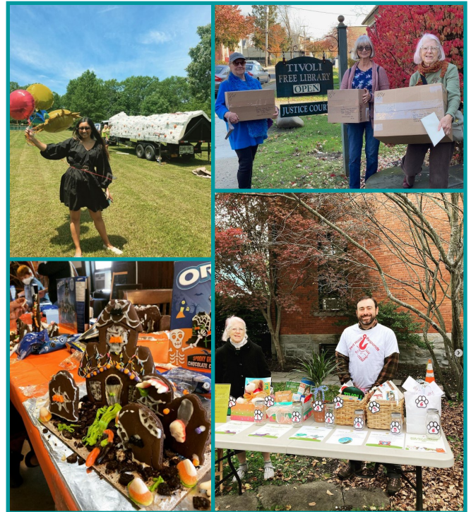
Clockwise from top left: Arobi & the Climbing wall; Hooks & Needles members dropping off their Red Scarf donations; the Great Give Back; Spooky Cookie House Halloween.